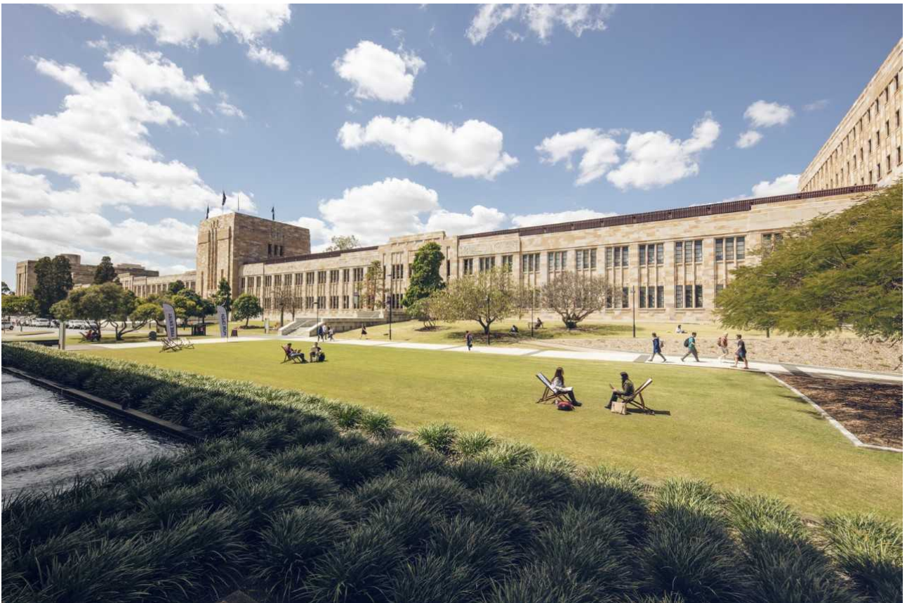
Figure E.1: The University Of Queensland

The Figure E.1 represents beauty of the UQ campus.